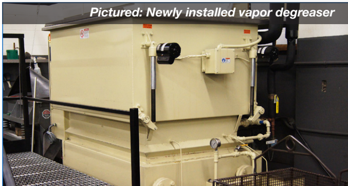
Pictured: Newly installed vapor degreaser

Additionally, they wanted to proactively comply with the increasingly stringent environmental recycling and disposal regulations being imposed by the federal and regional EPA departments. Their challenge was how to find a new cleaning fluid that would clean their parts and meet business needs around cost, while still improving worker safety and lessening the impact to the environment.