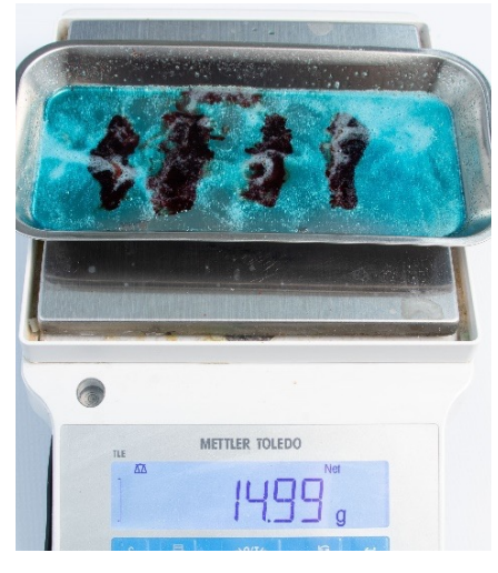
Fig. 14. OptiPro® Bovine Protein Soil Efficacy Test @ 0 hrs