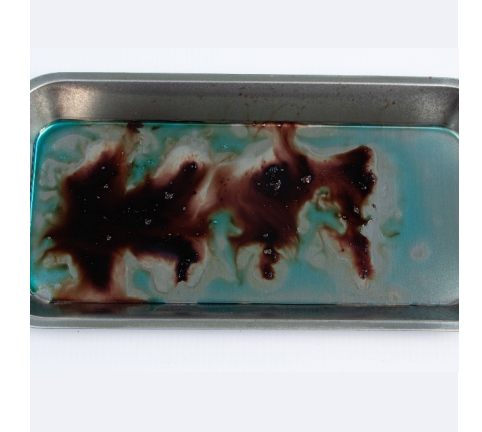
Fig. 12. Prepzyme® Forever Wet Bovine Protein Soil Efficacy Test @ 24 hrs