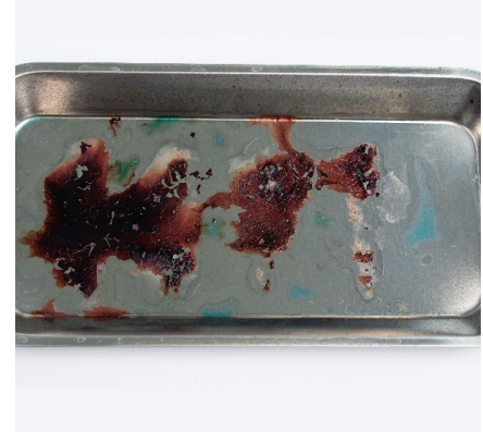
Fig. 13. Prepzyme® Forever Wet Bovine Protein Soil Efficacy Test @ 72 hrs, Post-Rinse and Dry