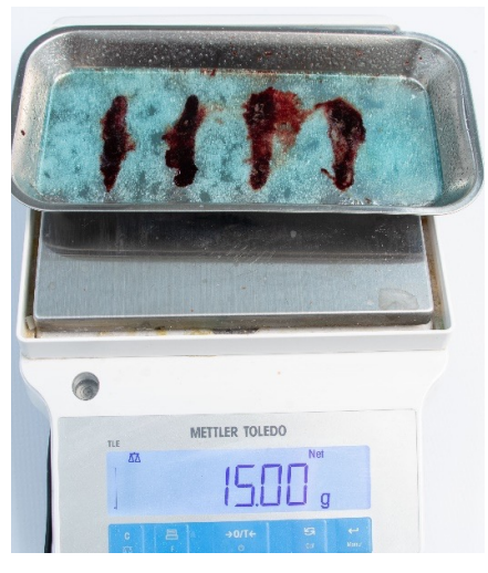
Fig. 11. Prepzyme® Forever Wet Bovine Protein Soil Efficacy Test @ 0 hrs