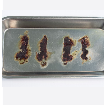
Fig. 7. ProEZ Gel<sup>™</sup> No Bacillus Bovine Protein Soil Efficacy Test @ 72 hrs, Post-Rinse and Dry