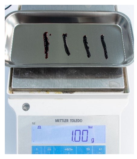
Fig. 1. Bovine Protein Soil Efficacy Test Pre-Application