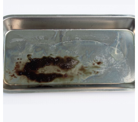
Fig. 16. OptiPro® Bovine Protein Soil Efficacy Test @ 72 hrs, Post-Rinse and Dry