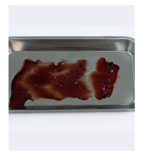
Fig. 9. PRE-Klenz® Bovine Protein Soil Efficacy Test @ 24 hrs