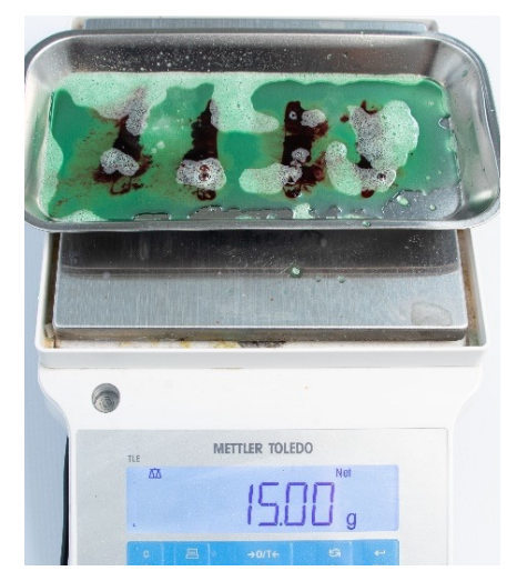
Fig. 5. ProEZ Gel<sup>™</sup> No Bacillus Bovine Protein Soil Efficacy Test @ 0 hrs