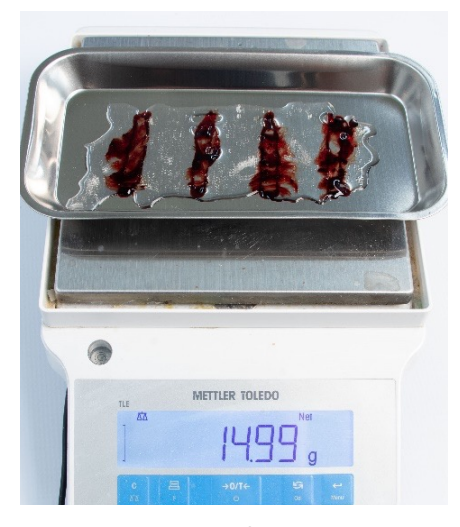
Fig. 8. PRE-Klenz® Bovine Protein Soil Efficacy Test @ 0 hrs