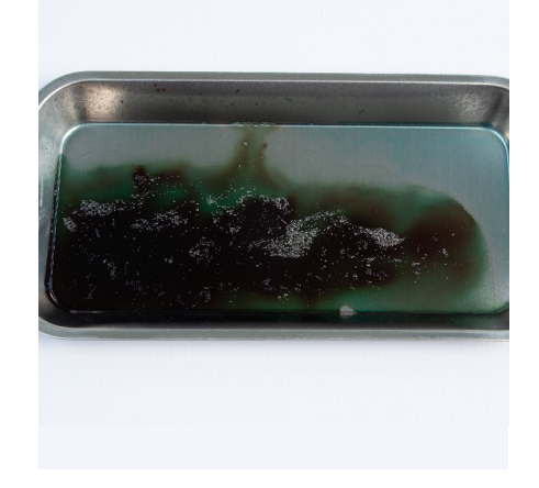
Fig. 15. OptiPro® Bovine Protein Soil Efficacy Test @ 24 hrs