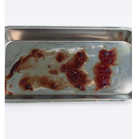
Fig. 10. PRE-Klenz® Bovine Protein Soil Efficacy Test @ 72 hrs, Post-Rinse and Dry