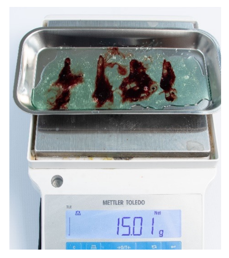
Fig. 2. ProEZ Gel<sup>™</sup> Bovine Protein Soil Efficacy Test @ 0 hrs