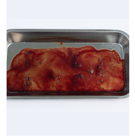
Fig. 3. ProEZ Gel<sup>™</sup> Bovine Protein Soil Efficacy Test @ 24 hrs