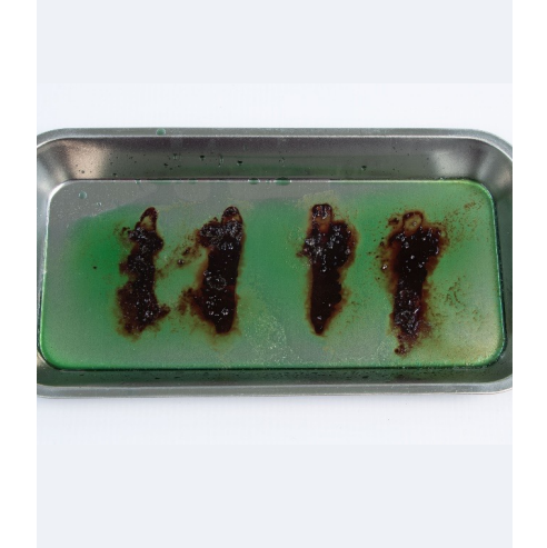
Fig. 6. ProEZ Gel<sup>™</sup> No Bacillus Bovine Protein Soil Efficacy Test @ 24 hrs