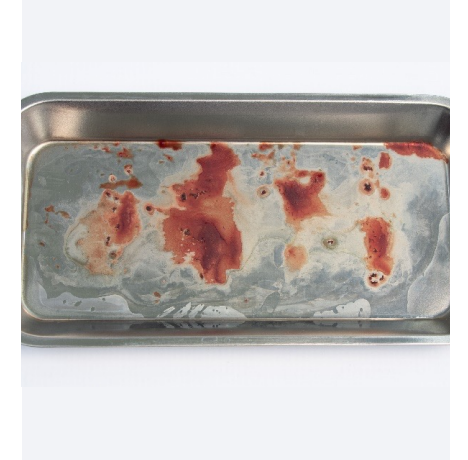
Fig. 4. ProEZ Gel<sup>™</sup> Bovine Protein Soil Efficacy Test @ 72 hrs, Post-Rinse and Dry