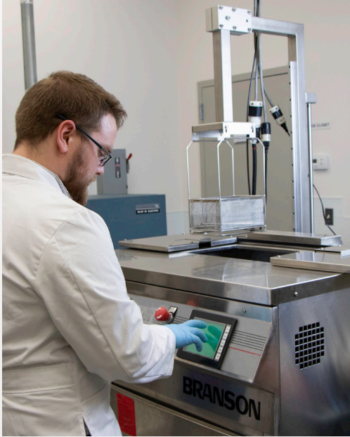
Lab cleaning trials are performed to determine the best PCBA cleaning fluid and method.