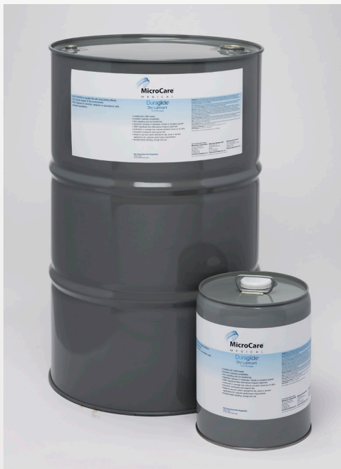
Duraglide™ reduces the coefficient of friction to as little as 0.06.

Once the system is programmed, operation could not be easier. Clean parts are loaded into the basket and the basket is placed on the hoist. As the coating process begins, the operator is free to leave and perform other tasks. The system slowly drops the parts into the coating fluid, keeps them submerged for the allotted time, and then slowly raises the parts into the vapor for drying. Ultimately the parts come out clean, dry, and evenly coated with the Duraglide dry lubricant. Throughput is fast: cycle times range from 30 seconds to 3-4 minutes, depending upon the application and the repeatable process makes validation easy.