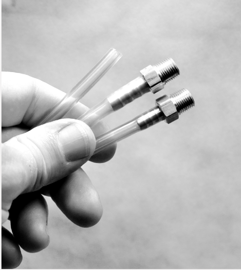
A silicone swelling agent significantly improves assembly times.