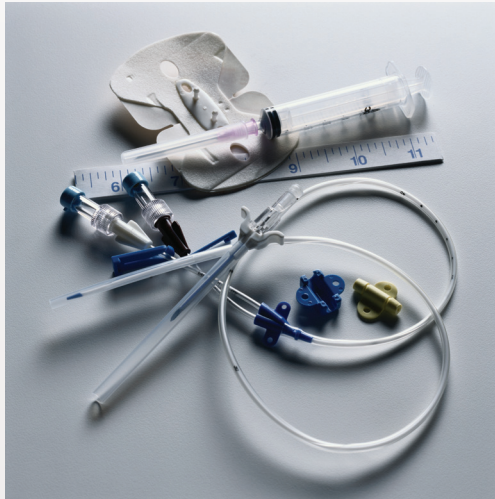
Swelling fluid makes medical device assembly easier and faster.