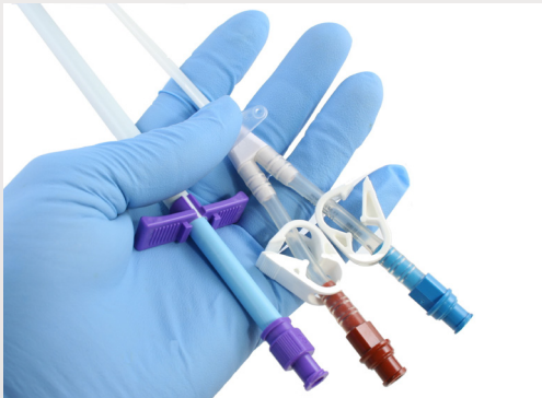
Swelling fluid allows the tubing to easily slide over fittings or other connectors.