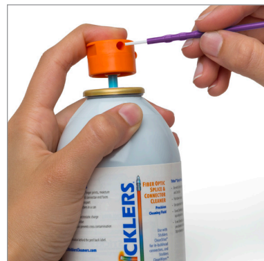
Wet cleaning tools prior to cleaning to reduce static and improve results.

So, when you need perfectly clean splices and connectors, Sticklers can provide you with an IPA substitute. The Sticklers Fiber Optic Splice and Connector Cleaner makes an ideal IPA replacement.