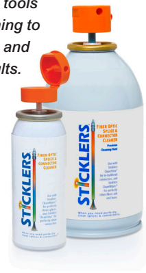
Optical grade IPA replacement cleaning fluids are fast-drying, static dissipative and sold in hermetically sealed packaging.