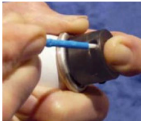
3) Dampen (do not saturate) the end of the CleanStixx™ with Sticklers™ Fiber Optic Splice & Connector Cleaner.