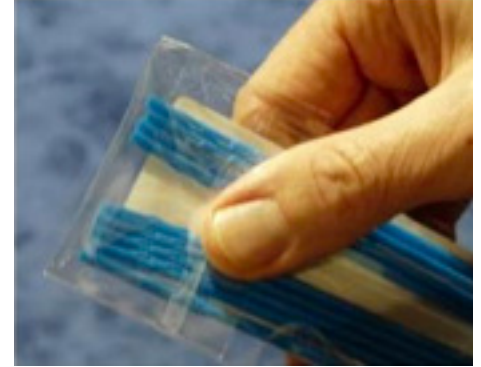
2) Reseal the package to prevent re-contamination of remaining sticks.