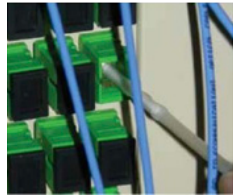
4) Insert the stick into the alignment sleeve and rotate the stick 1/4 turn back and forth about 6 times varying the pressure (enough pressure should be intermittently exerted on the stick so that the user can feel some “give” in the spring behind the ferrule – this will assure good cleaning of the entire end-face).