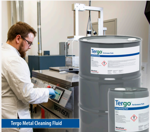
Sustainable metal cleaning fluids make ideal long-term replacements for less planet-friendly solvents like nPB, Perc and TCE.

Many of the new sustainable metal cleaning fluids are based on HFO (hydrofluoroolefin) technology that offers excellent performance along with improved environmental properties. Unlike the legacy cleaners that were based on HFCs (hydrochlorofluorocarbons), the new cleaning fluids have a very low GWP which helps reduce greenhouse gas effects, and low VOC content to meet strict regional air quality regulations.