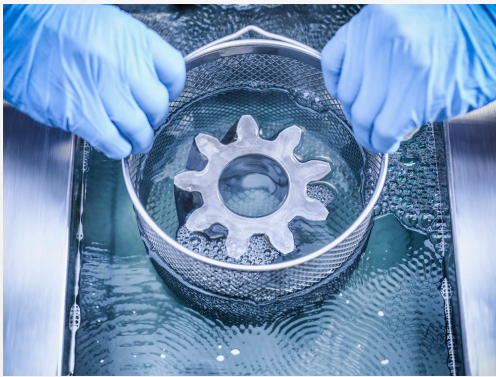
Today's modern metal cleaning fluids meet strict global environmental regulations.