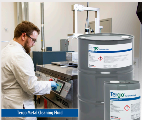
Vapor degreasing is an environmentally sound way to clean metal parts.