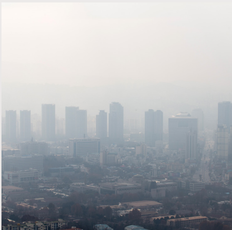
nPB has a high VOC rating that contributes to smog due to its release of harmful emissions into the air.