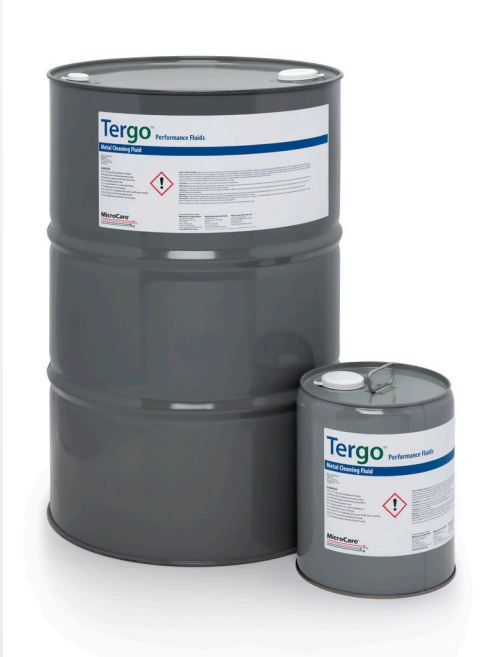
MicroCare offers effective nPB replacements.

as nPB. Cleaning efficiencies were maintained or improved. Using a nPB replacement fluid improves or increases cleaning consistency. This reduces scrap and rework which lessens the amount of raw materials used to complete an order. Plus, fewer scrapped parts make it to the landfill.