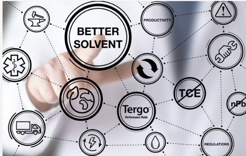
Some companies are switching from nPB to newer, safer cleaning fluid alternatives.

Chronic exposure to nPB can cause a whole host of health issues for humans. These range from slight dizziness, headaches, upset stomachs, skin rashes and irritation to the eyes and throat to more severe problems. These include damage to the central nervous system, kidneys, liver, immune system, reproductive system, and even cancer.