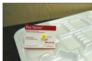
5. Place Pro Tector Prop on tray with open end of cap facing up.