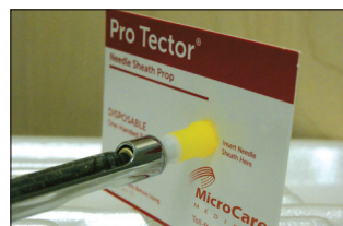
3. Insert needle cap through hole up to collar of cap.