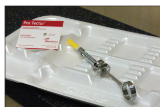
1. Assemble syringe with anesthetic and capped needle as usual.