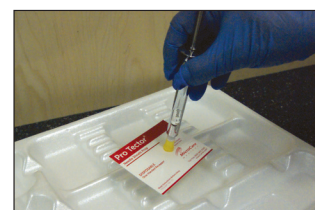
6. Use one-handed technique to recap. Insert needle into cap; bring syringe vertical, push down slightly.

For a How-To-Use video on this product, please visit us online at: MicroCare.com/Certol