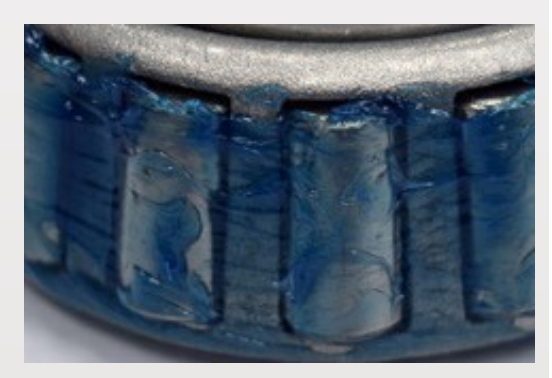
Opteon SF80™ is ideal for removing organic soils like machining and stamping oils and grease

surfactants, stearates and polishing pastes. A particulate electrostatically bonds to part surfaces and requires a dense cleaning fluid like Opteon™ SF80 to break that bond. It then displaces the contaminant and floats it off the part substrate.