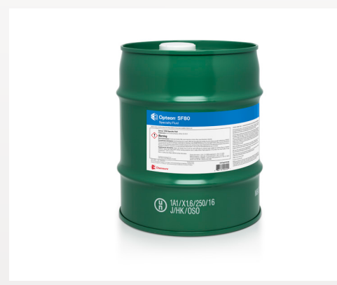
Environmentally-safer cleaning fluids such as Opteon™ SF80 Specialty Fluid have a low GWP and zero ODP