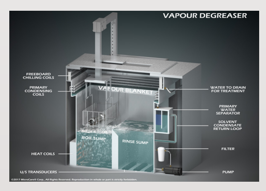
Vapor degreasing is a fast, effective and planet-friendly method for cleaning parts