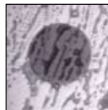
A dirty connector end-face and one properly cleaned.

[Photo 5] Drag the connector through the damp spot down to the dry area. Dispose of wipe. Inspect the end-face to verify cleanliness and mate connector.