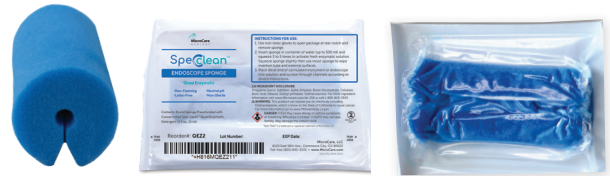
Individually vacuum-packed, pre-saturated foam sponge is designed for single-use.

Spec Clean Endoscope Sponges are convenient for bedside precleaning procedures on endoscopes, transducer probes and related devices immediately after patient care. The individually vacuum packed foam sponge is pre-saturated with ProEZ AW Quad™ enzymatic detergent.