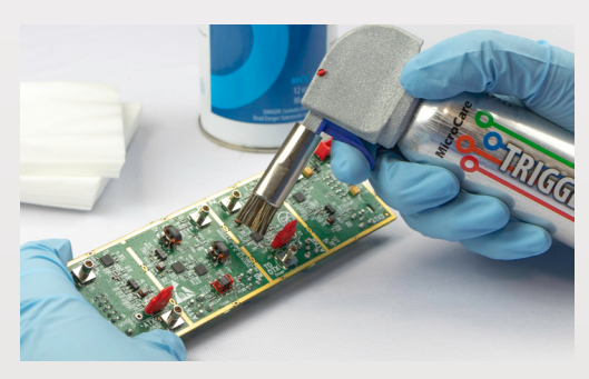
The TriggerGrip<sup>™</sup> improves benchtop cleaning results, reduces cleaning fluid waste and enhances worker safety.

Today's sophisticated PCBs need a better cleaning method than the old dip-and-brush.