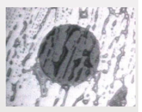
A fiber optic end-face contaminated with fingerprint oil.