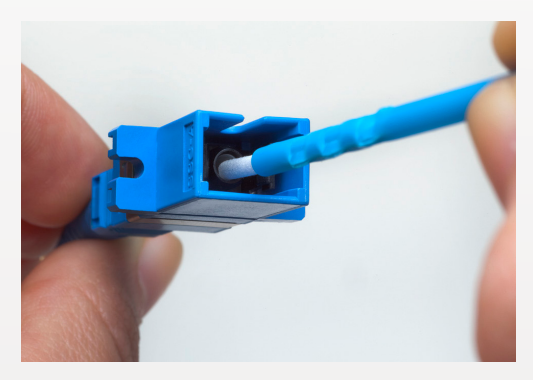
A fiber optic cleaning stick cleans a fiber optic termini end-face.