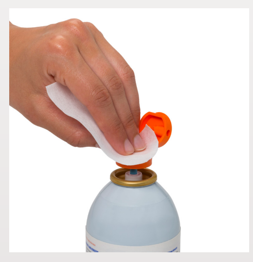
A cleaning fluid and wipe dissolves contaminants and helps eliminate static.

of high-purity cleaning fluid on the corner of a dry wipe or the tip of the swab then apply the fiber optic termini.