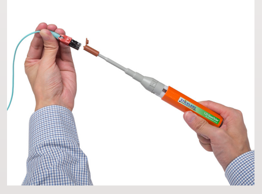
A clicker-type cleaner provides hundreds of cleans before it must be replaced.