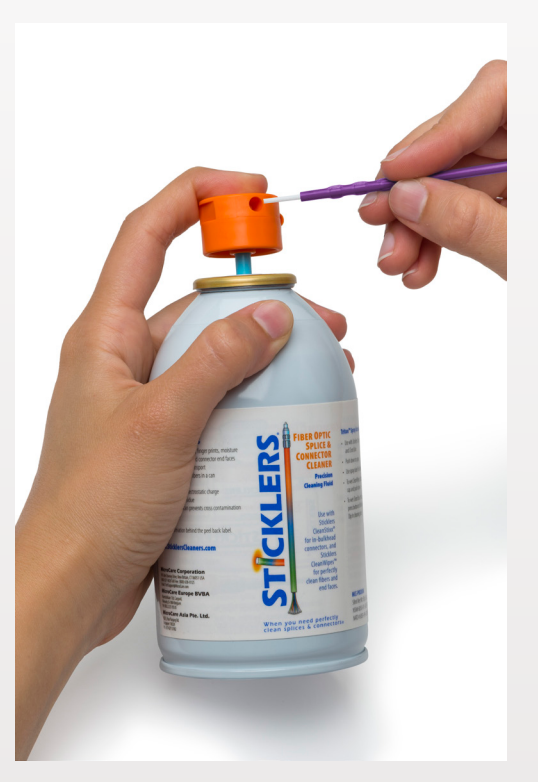
Specify a pure optical grade cleaning fluid for best success.