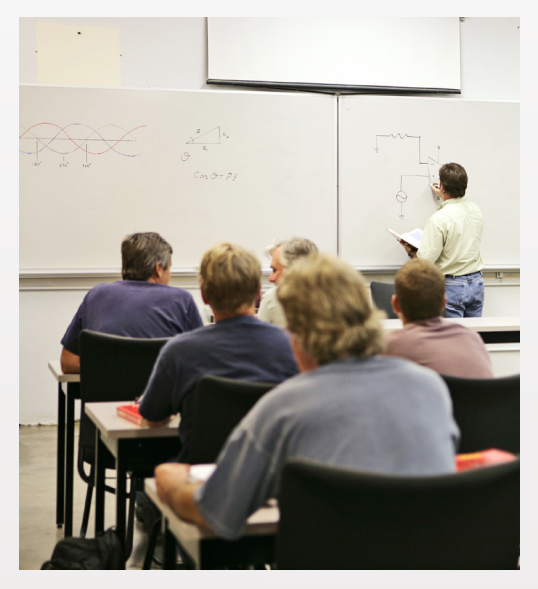
Anybody who specifies, installs or repairs fiber optic systems requires training.