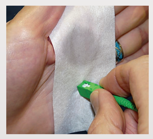
Wet/dry cleaning helps eliminate electrostatic charges.