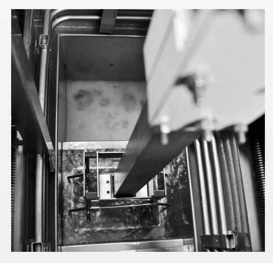
The vapor degreasing machine contains two chambers: the boil sump and the rinse sump.

$50,000-$70,000. It holds 50 gal of solvent and is 90 inches long x 36 inches deep. It uses 12 kW of power at startup, about 6 kW in continuous use and about a tenth of that power during stand-by mode depending upon the solvent.