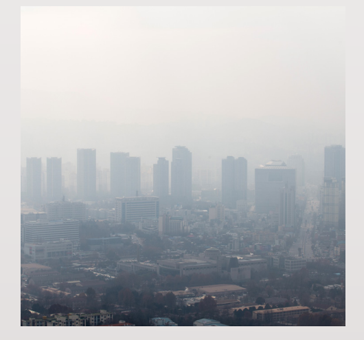
TCE contributes to smog due to its release of harmful emissions into the air.