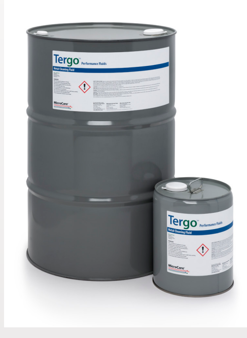
MicroCare offers effective TCE replacements.

replacements are not a HAP (Hazardous Air Pollutant) and may not require NESHAP (National Emission Standards for Hazardous Air Pollutants) permits.