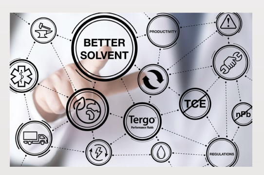
Some companies are switching from TCE to newer, safer cleaning fluid alternatives.