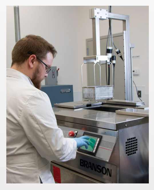
MicroCare technical experts can help you smoothly transition from TCE to a better cleaning fluid.

prior to painting, plating, welding or subsequent processing. The type of contamination you face will help dictate which trichloroethylene replacement cleaning fluid will work best.