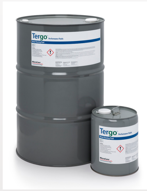
Azeotropes are blends of two or more components, when mixed together behave as if they were one chemical.