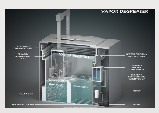
Vapor degreasing uses solvent immersion, combined with vapor rinsing and drying to remove all types of contaminant.