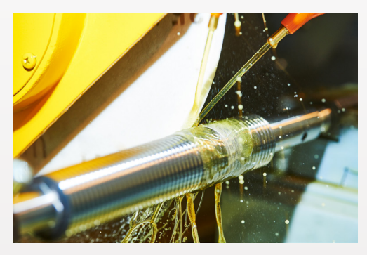
Contaminants vary from machining oils, metal fines, fluxes and inks to greases, fingerprints and waxes.