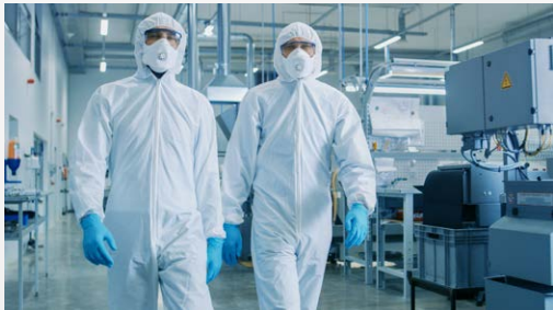
Vapor degreasing helps manufacturers meet FDA and ISO requirements