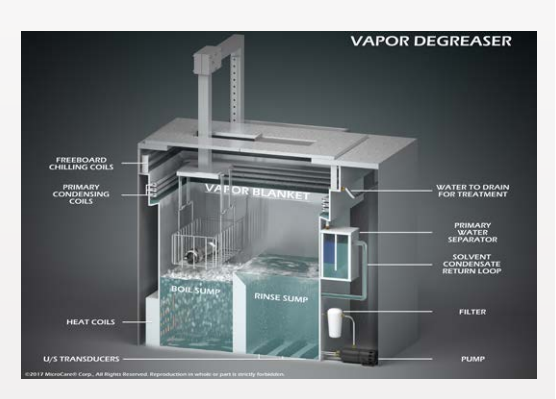
Vapor degreaser cleaning is a well-engineered process that is simple, predictable and repeatable