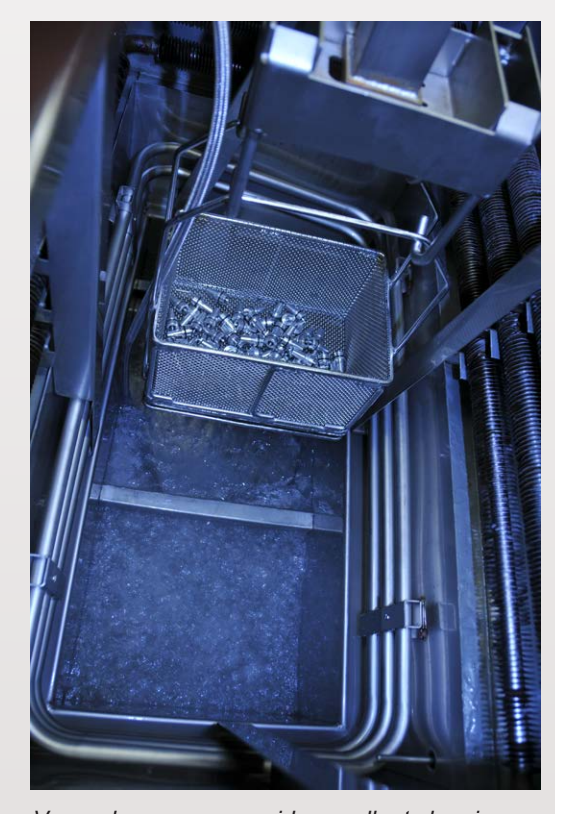
Vapor degreasers provide excellent cleaning results on parts of any size and almost any geometry