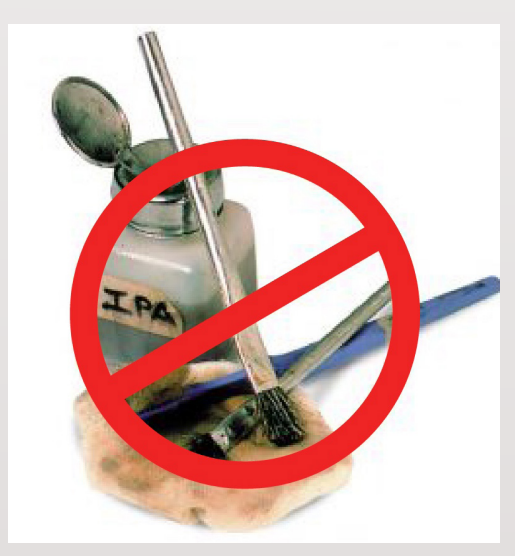
The dip and brush cleaning method can lead to cross-contamination.